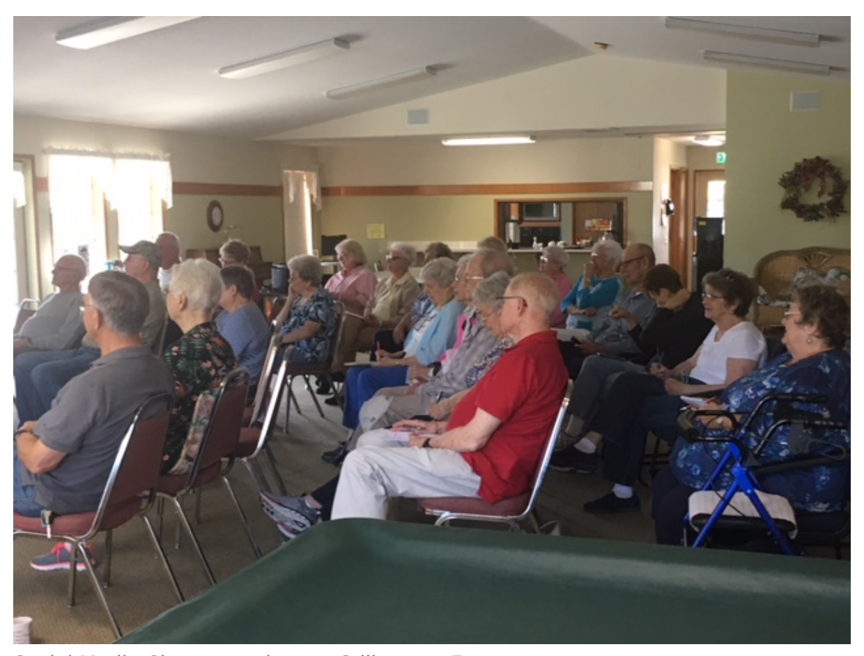
Social Media Class attendees at Stillwaters Estates

Residents of Stillwaters Estates had a great opportunity this week to hear all about Social Media for Seniors. Spry Digital Marketing, our local website producers, presented a class on Social Media use, safety and "making the best of" techniques. About 25 residents attended and it was an enthusiastic group.