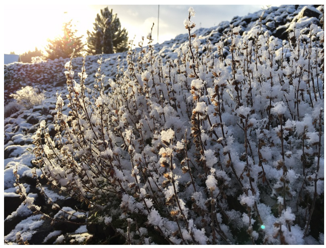
Morning Sun on the Snow

This month has been full of interesting weather. Earlier this month we had lovely snow. This was the view in my backyard one morning. It was the perfect kind of snow. It stayed long enough to be admired but not too long so as to be annoying!